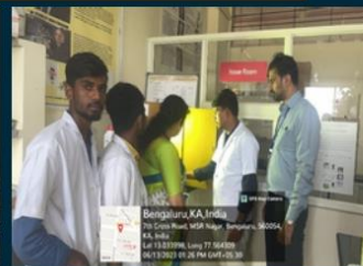
MoU with KLE College, SJR College, Indian Academy College (Autonomous College) and MLA College (Autonomous) from 2022 to 2023 academic year.