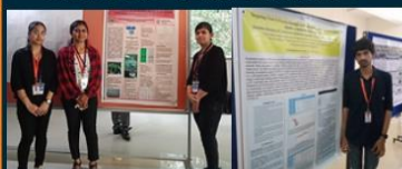
National Conference on Contextual Approaches in Applied Microbiology (NCCAM-2023) on 8th - 9th June, 2023