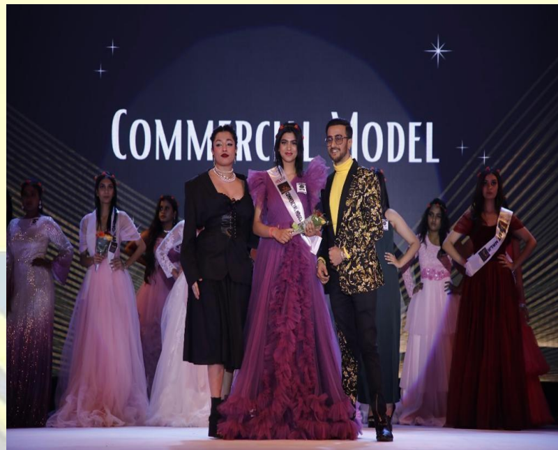
Won first runner of 'Face of sandalwood', and Face of Fashion's 'Miss Congeniality'