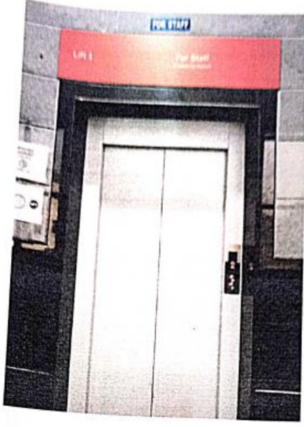
Lift no. 1 for staff

ಎಮ್ ಎಸ್ ರಾಮಯ್ಯ ಕಲಾ, ವಿಜ್ಞಾನ ಮತ್ತು ವಾಣಿಜ್ಯ ಕಾಲೇಜು M S Ramaiah College of Arts, Science and Commerce Re-accredited 'A' by NAAC, Permanently Affiliated to Bengaluru City University, Approved by Government of Karnataka, Approved by AICTE, New Delhi, Recognized by UGC under 2f & 12B of UGC act 1956