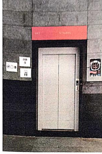
Lift no. 2 for students