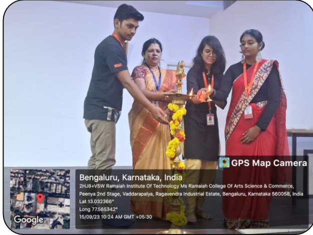
Hindi Diwas 15 th Sep 2023

The Department of Hindi conducted several competitions on the occasion of Hindi diwas. Nibandh lekhan and Aashubhashan and Shaayari were conducted on September 7th and 8th respectively. Students from all the departments actively participated and made it a grand success. The best participants were selected and awarded prizes on 15 September, Hindi Diwas in the APJ Abdul Kalam auditorium.