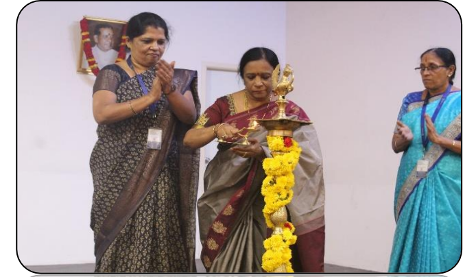
Samskrita Dinam 05 th Sep 2023